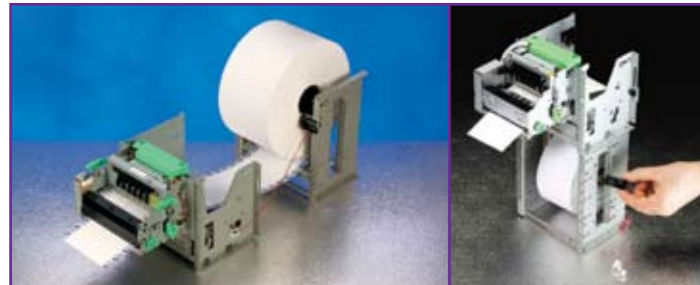
25cm diameter High Volume Paper Roll Supply option for Vertical or Horizontal use

Both the TUP500 & TUP900 series feature generous 15cm diameter paper roll handling as standard. However, with the option RHU-T900 or RHU-T500, 25cm diameter paper roll could be used in landscape mode or 18 cm diameter roll when used in vertical mode.