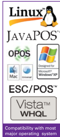
Compatibility with most major operating system

Same as other Star printers, TUP500 & TUP900 come with a quality suite of device drivers for easy integration into the majority of today's operating system: Windows™, Linux™, Mac™ and POS.Net™ etc.